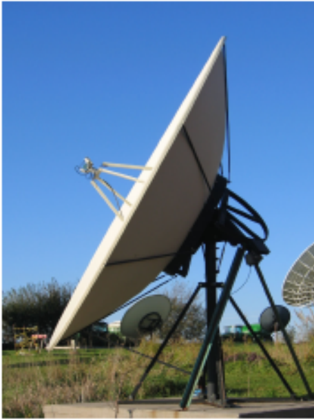
C-Band satellite dish